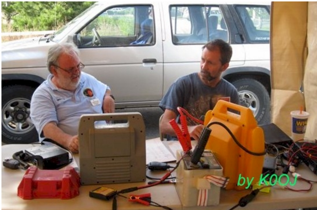
Setting up the QRP CW station at the WARS tent.