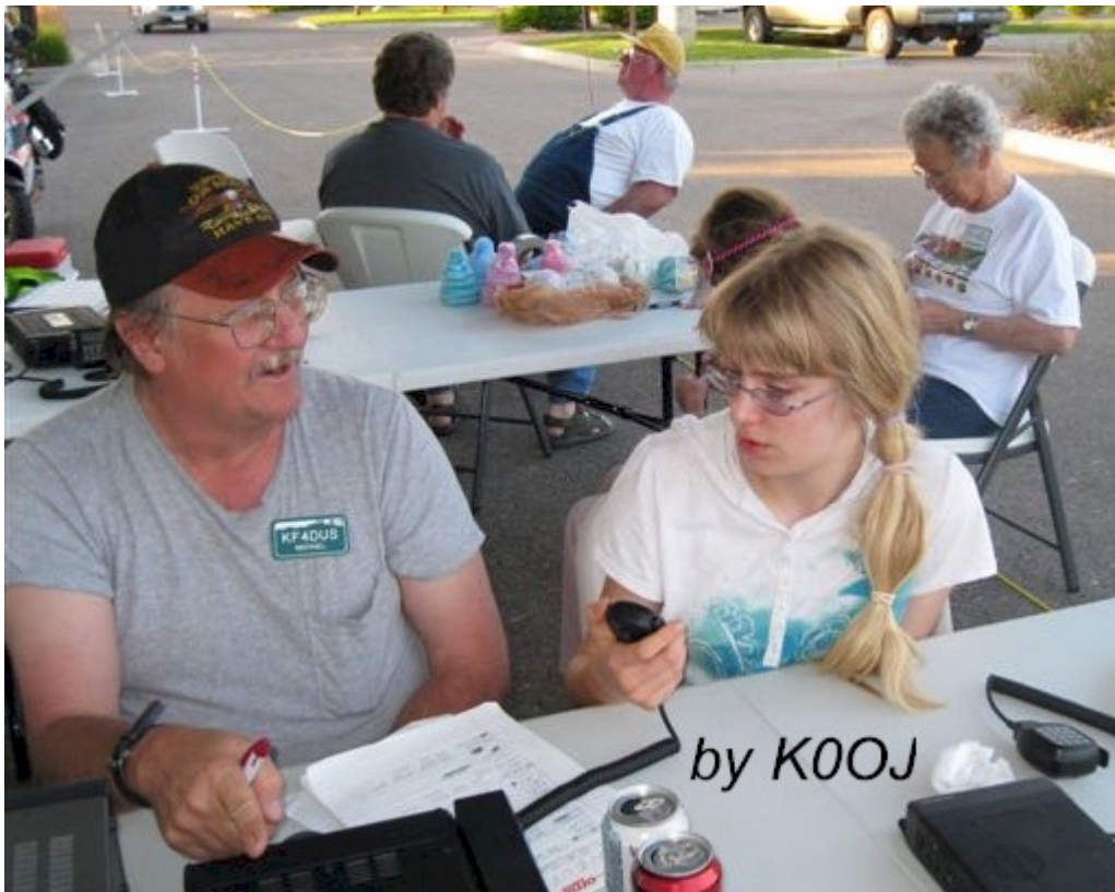
As always, this is a team effort!