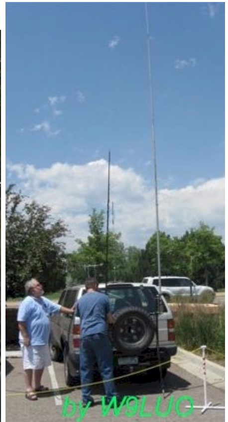
Sometimes ya just gotta adjust the antenna for best reception.