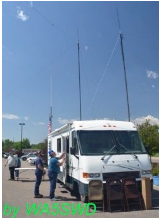
Setting up Willie's motor home