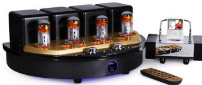
Fatman Itube 452 Tube Amplifier with iPod Dock

Mostly "vintage" tube amps and radios, there are a selection of these venerable devices being sold, traded and most likely not given away..... If you are thinking about that $2K i-Pod docking station with 12AX7 Svetlana preamp tubes and orange and blue LEDs to color up the effect, the Vintage Voltage Expo would likely be a good place to pick one up.