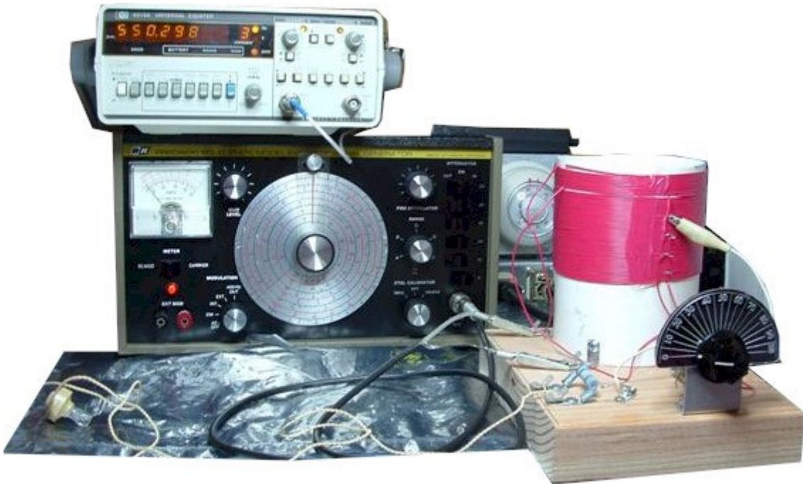
TESTING THE TUNING RANGE

It's a KBØNE project with a little present day nostalgia.